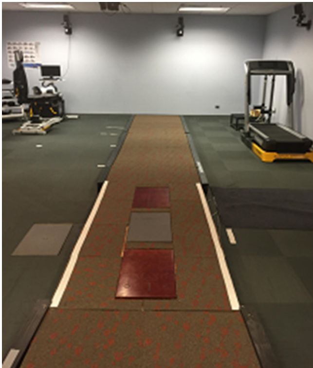
Figure 1. Walkway used for 3-dimensional motion capture. The participant walked independently and with a human guide on the raised platform. Researchers were present alongside the platform during walking for participant safety. Three in-line force platforms captured ground reaction forces

a requirement for determining bilateral limb work. During warm-up trials, the subjects' self-selected speeds were recorded with electronic timing gates and used to determine average self-selected speeds. The VI group performed 5 successful trials in each of the 2 walking conditions: independently using their own walking cane and with a human guide. The VI group was instructed to walk at their own self-selected speeds for both walking conditions. For guided walking, an experienced sighted guide walked on the preferred side of the subject with the subject's hand placed on the guide's elbow and a half step behind the guide. The guide reminded the subject during each trial that the subject was to set the walking speed [14]. In all walking conditions, researchers were present with the VI subjects to ensure safety on the walkway. In the VI group, walking speeds were dependent on the comfort level of the subjects, and thus were not standardized between walking conditions. In both VI and control groups, the subjects performed 5 successful trials of level walking at \pm 5\% of their average self-selected speeds. A successful trial included full foot contact on the force plates.